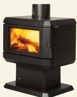
Above: Albany wood fire (F200B-1)